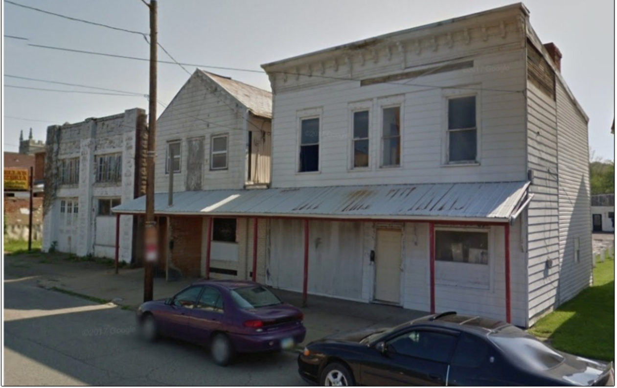
56 N. Main Street in Roseville, Ohio (photo from 2012) January 1903 - Roseville Merchandise Company was established